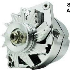
SINGLE WIRE ALTERNATOR