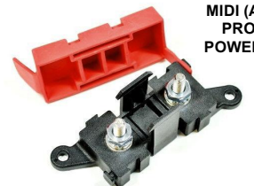
100 AMP MIDI (AMI) FUSE PROTECTS POWER CENTER

Two separate 10 awg power cables MUST BE INSTALLED. One to each side of the Power Center (Battery In terminals)