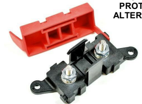
100 AMP MIDI (AMI) FUSE PROTECTS ALTERNATOR

The Alternator provides all power to the vehicle when the engine is running, so it is best to connect the Alternator to the same fuse as the Power Center as shown.